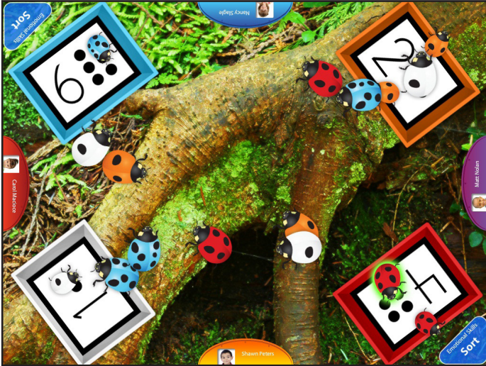
Sort Activity Ladybug Sort