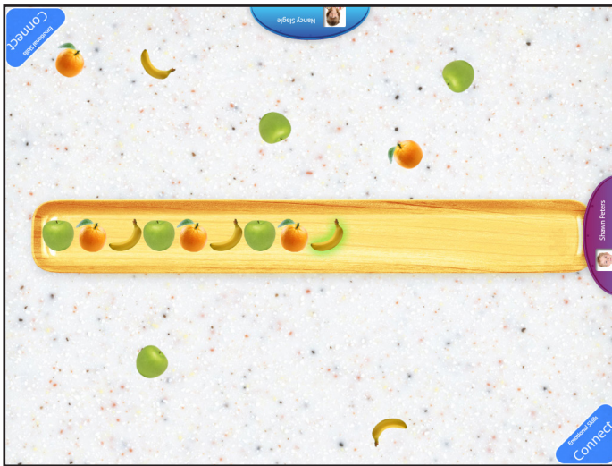
Connect Pattern Activity Fruit Pattern 2