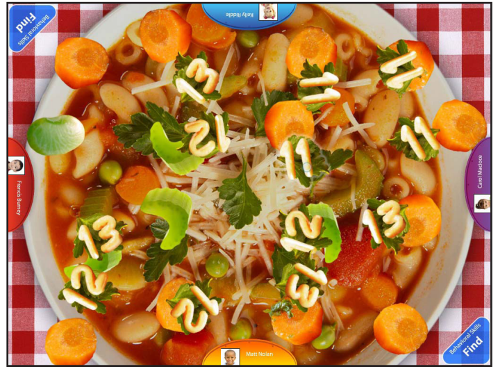
Find Activity Number Soup Find