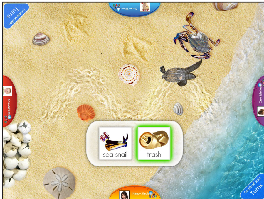
Turns Activity Taking Turns: Sea Turtle Journey