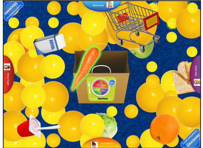
Uncover Activity Healthy Lunch Uncover